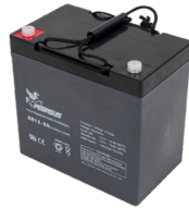
12V 55AH BATTERY