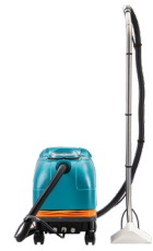
Hydromist® 20HD HM20HD