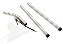
STANDARD CARPET TOOL