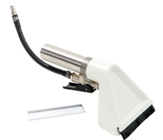
HEAVY DUTY UPHOLSTERY TOOL