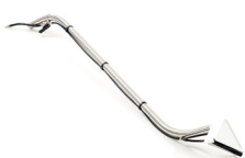
HEAVY DUTY CARPET TOOL