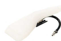
STANDARD UPHOLSTERY TOOL