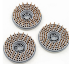
BRONZE WIRE 18G BRUSHES