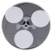
VELCRO DRIVE DISC