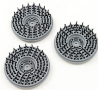
STEEL WIRE 18G BRUSHES