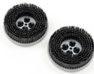
CRIMPED WIRE BRUSHES