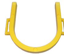
HORSESHOE WEIGHT (17KG)