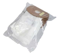
MICROFIBRE DUST BAGS