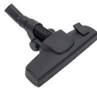
ECO FLOOR TOOL