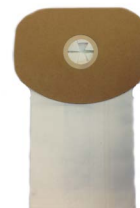
PAPER DUST BAGS