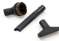
SMALL ACCESSORY KIT