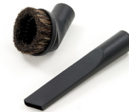
CREVICE TOOL & DUSTING BRUSH