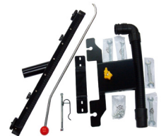
FIXED FLOOR NOZZLE