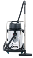
Valet Aqua 75 Industrial VA75IND