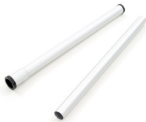
EXTENSION TUBE SET