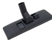
DRY FLOOR TOOL