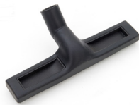
WET FLOOR TOOL