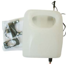
SOLUTION TANK (5 LITRES)