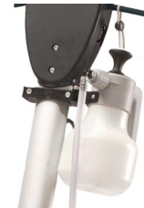
SPRAY SYSTEM KIT