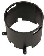
12.5KG ADDITIONAL WEIGHT